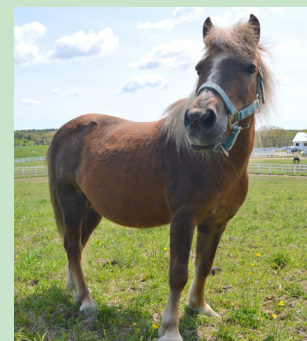
Roger: 25yo, Shetland Pony, Gelding