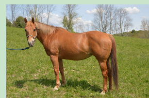
Rain: 25yo, Quarter-horse, Mare