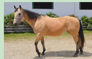
Noel: 14yo, Quarter-horse, Mare, 15hh