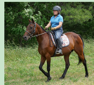
Tess: 18yo, Standard-bred, Mare, 14.3hh, Rides, Drives

Here are just a few of our horses available for adoption. Visit our website for a complete up-to-date listing.