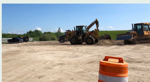
Help, Hope, Home gets underway – on May 29th, construction began on the Society's indoor training arena and humane education center