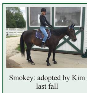
Smokey: adopted by Kim last fall