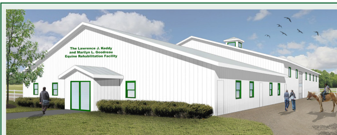
Artist's rendition of the new facility, to be completed this fall

Please support Help, Hope, Home with your tax-deductible gift to the Maine State Society for the Protection of Animals.