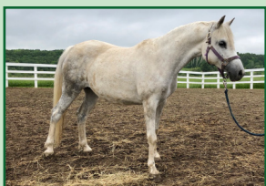
Rita, Arabian Mare