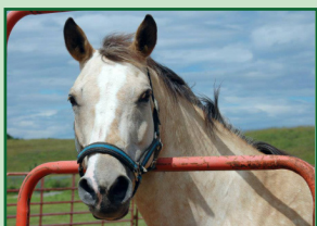
Honey Rose, QH Mare