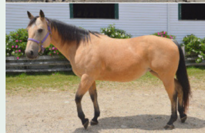
(top) Noel when she arrived at the MSSPA in December 2015