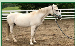
Mia, Grade Mare

Here is a sampling of the MSSPA horses available for adoption. Visit our website for a complete listing.