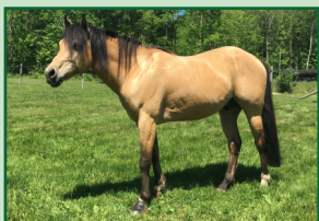
Buck, QH Gelding