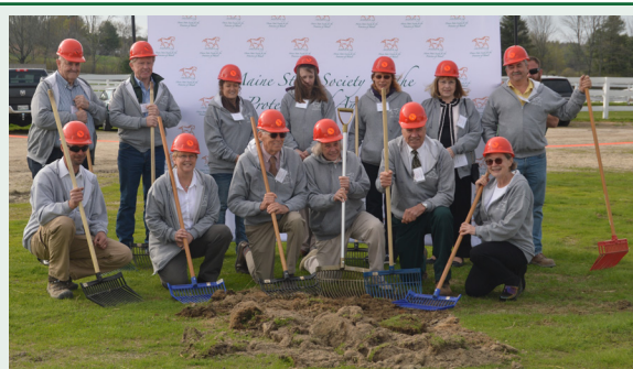
On May 10th, the MSSPA board of directors and building committee broke ground for the Lawrence J. Keddy and Marilyn L. Goodreau Equine Rehabilitation Facility

This project serves the horses and the people who care about them.