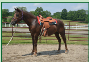
Romeo, QH Gelding