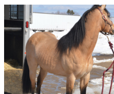
Buck soon after arrival