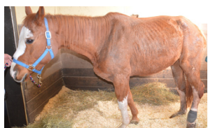
Scotch upon arrival to MSSPA

Visit msspa.org/buck to read the whole story of Buck and Scotch, including the critical training services provided by Horses with Hope. No easy access to the internet? Please call the Society and we will gladly mail you a paper copy of the full story posted on the website.