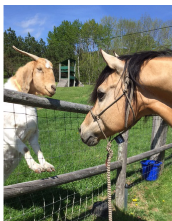
Buck makes a new friend