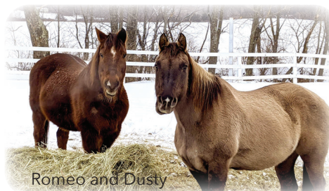
Romeo and Dusty

Hay provided by generous givers like you is appreciated in a variety of ways!