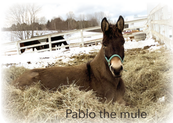
Pablo the mule